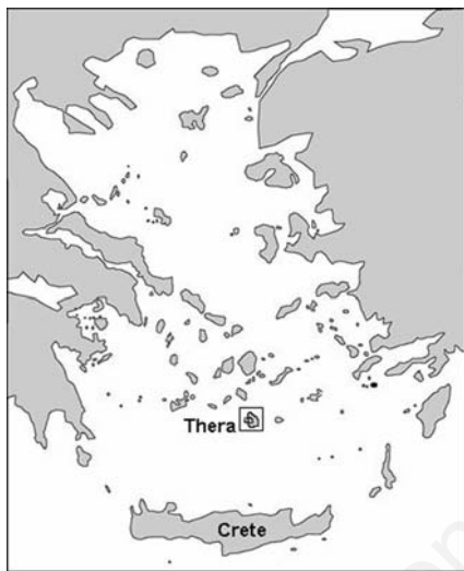
Figure 1. Location of Thera, Greece.

A recent attempt by Friedrich et al. (2006) to date a branch from an olive tree found in the volcanic tephra on Thera c. 7 km from